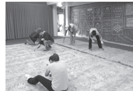
Volunteers help remove carpet and bolts.

We have reached the fundraising goal of $75,000 for the chapel renovations and work is currently underway. Renovations include installing new seating, carpeting, wood flooring and repainting the chapel. MVA owes a big thank you to alumni, parents, staff and friends for their prayers and financial contributions.