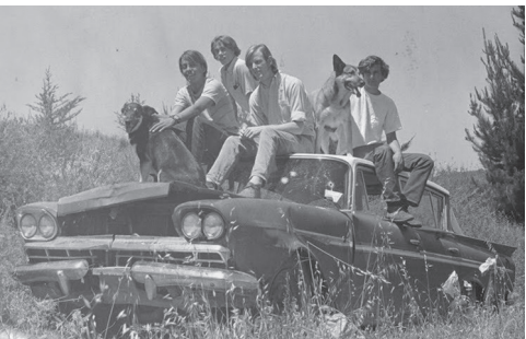
Santa Cruz Mountains