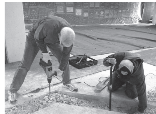
Trenches are cut in the cement for the upgraded wiring.

The upgraded electrical infrastructure will better accommodate future improvements in lighting and audio/visual equipment. The cost for these components was not included in the original fundraising goal. As dollars become available, the purchase and installation of the new equipment will be completed. If you would like to help with these final chapel upgrades, please designate on the enclosed envelope, that your gift is to be used for Chapel Lighting and A/V .